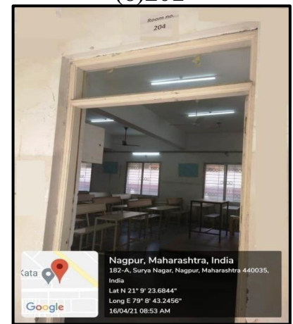
(9)204 (Seminar Hall)